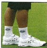
Soft spike golf shoe