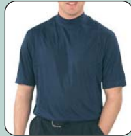
Collarless golf shirt