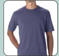
No collar. T-shirt style