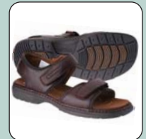
Sandals or Joggers