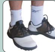
Logo other than 'National'