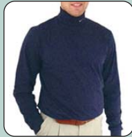
Golf style skivvy