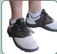
Visible ankle socks