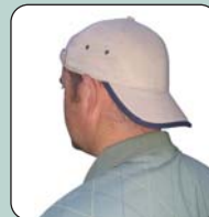
Cap back to front