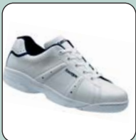
Sport golf shoe