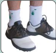
Plain white or 'National'