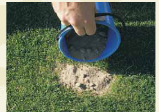
Divots in fairways and rough should be repaired.