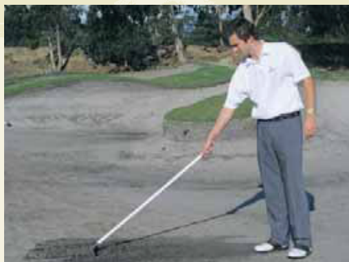
Bunkers should be raked after play and leave rake in middle of bunker.