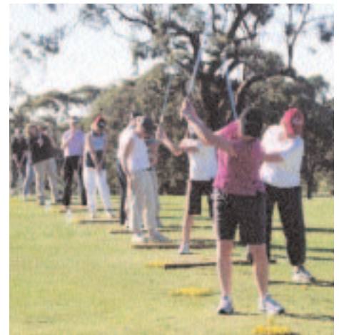
▲ Getting into the swing are a group of ladies during a Tuesday evening beginners' clinic.

When they do, we are here to provide them with everything they need to enjoy a lifetime of fun in this sport!