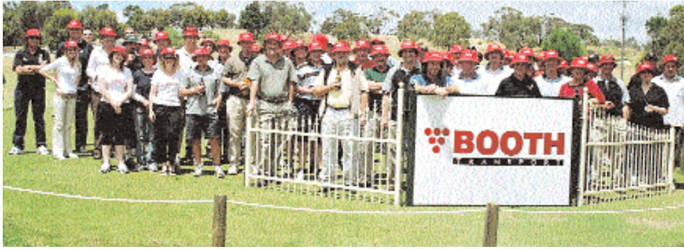
▶ Getting ready for a great day - the team from Booth Transport pictured on the first tee just prior to tee-off in their annual golf event in November.