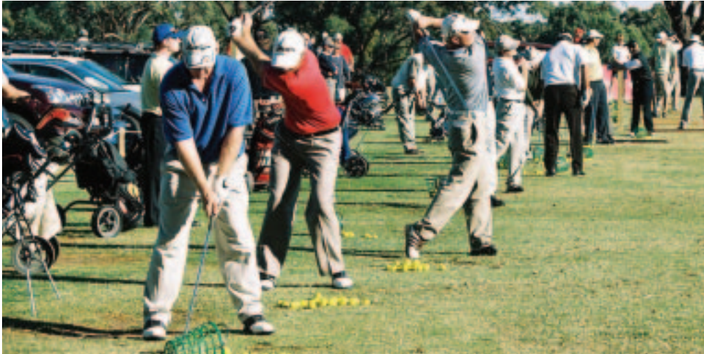
▲ PGA golf professionals warming up on the driving range at Tanunda Pines prior to the 2005 Pro Am.