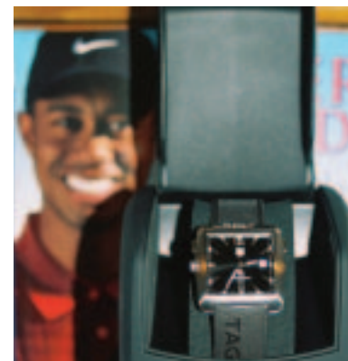
▲ You could win this Tag Heuer watch valued at $3000.

The competition will be drawn the last Saturday before Christmas. The more you play in competitions or make purchases from the golf shop of more than $20 value, the greater chance you have of winning 📌